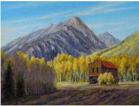
Hotel View, Ashcroft