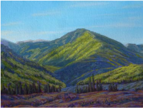
Green Mountain, Ashcroft