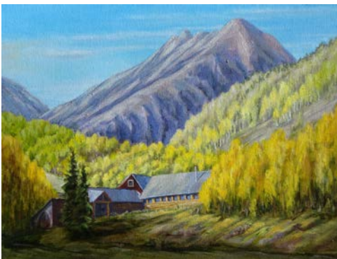
Catto Center at Toklat, Ashcroft