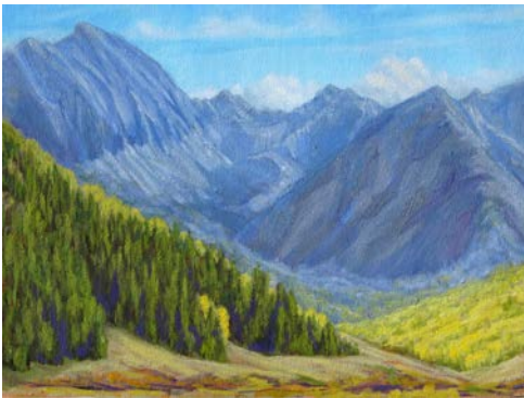
Star Peak, Ashcroft